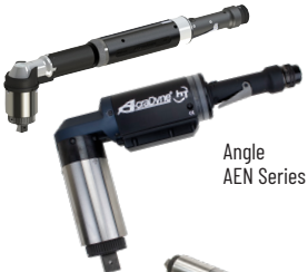
Angle AEN Series