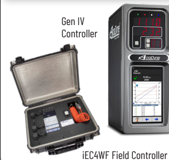
Gen IV Controller