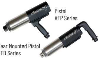
Pistol AEP Series

Torque Ranges 250-17,000 Nm (185-12,540 ft-lb)