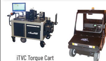
iTVC Torque Cart