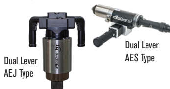
Dual Lever AEJ Type