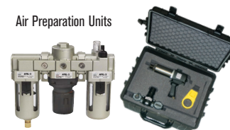
Air Preparation Units