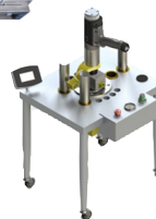
AHBTS Test Stand