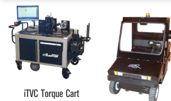
iTVC Torque Cart