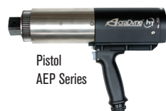
Pistol AEP Series

Torque Ranges 250–17,000 Nm (185–12,540 ft-lb)