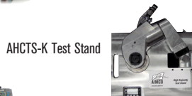
AHCTS-K Test Stand