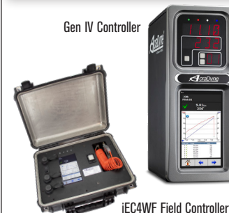
iEC4WF Field Controller