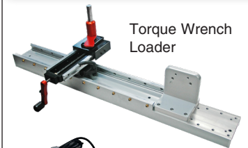
Torque Wrench Loader