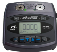
Bench Mount Tester