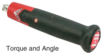
Torque and Angle