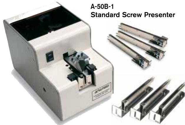
A-50B-1 Standard Screw Presenter