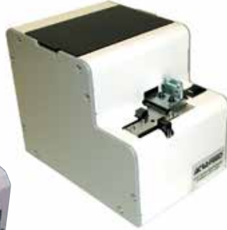
A-50BRBTC-4 Compact Robotic Screw Presenter