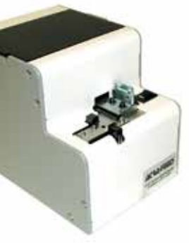
A-50BRBTC-4 Compact Robotic Screw Presenter