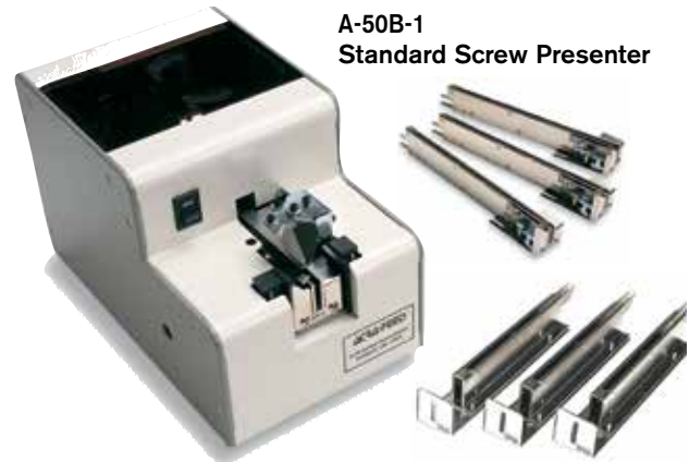
A-50B-1 Standard Screw Presenter