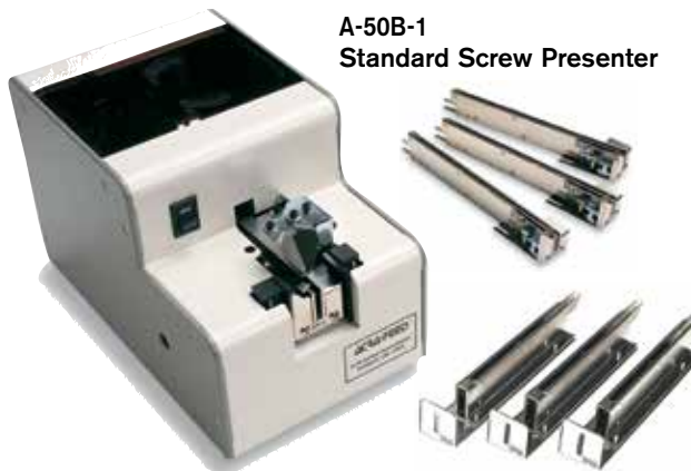
A-50B-1 Standard Screw Presenter