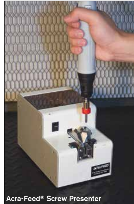
Acra-Feed® Screw Presenter