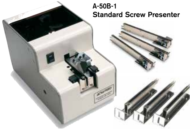
A-50B-1 Standard Screw Presenter