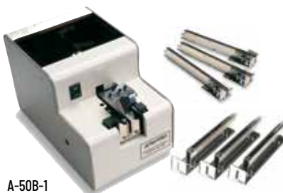
A-50B-1 Standard Screw Presenter

Bring screw to workpiece and fasten parts.