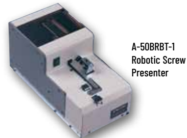
A-50BRBT-1 Robotic Screw Presenter