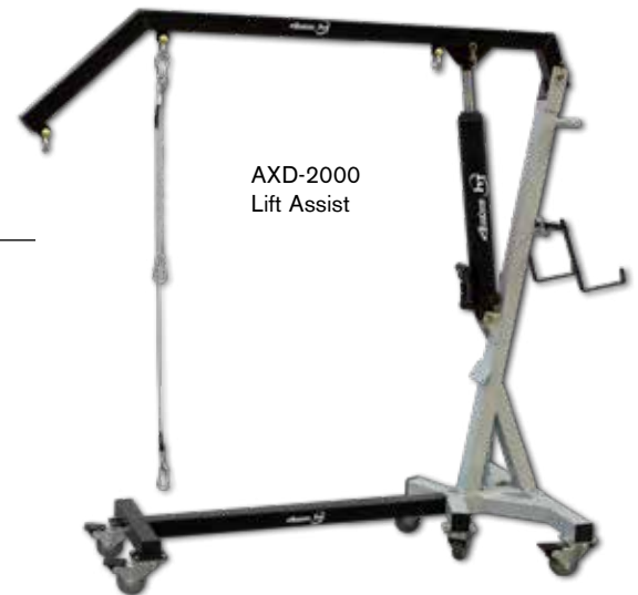
AXD-2000 Lift Assist