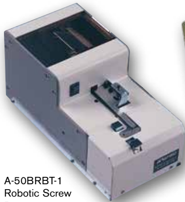
A-50BRBT-1 Robotic Screw Presenter