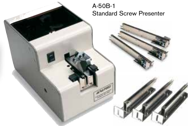
A-50B-1 Standard Screw Presenter